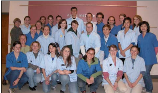
2007-2008 Pet Hospice Volunteers

For more information, contact us or visit our website at www.argusinstitute.colostate.edu .